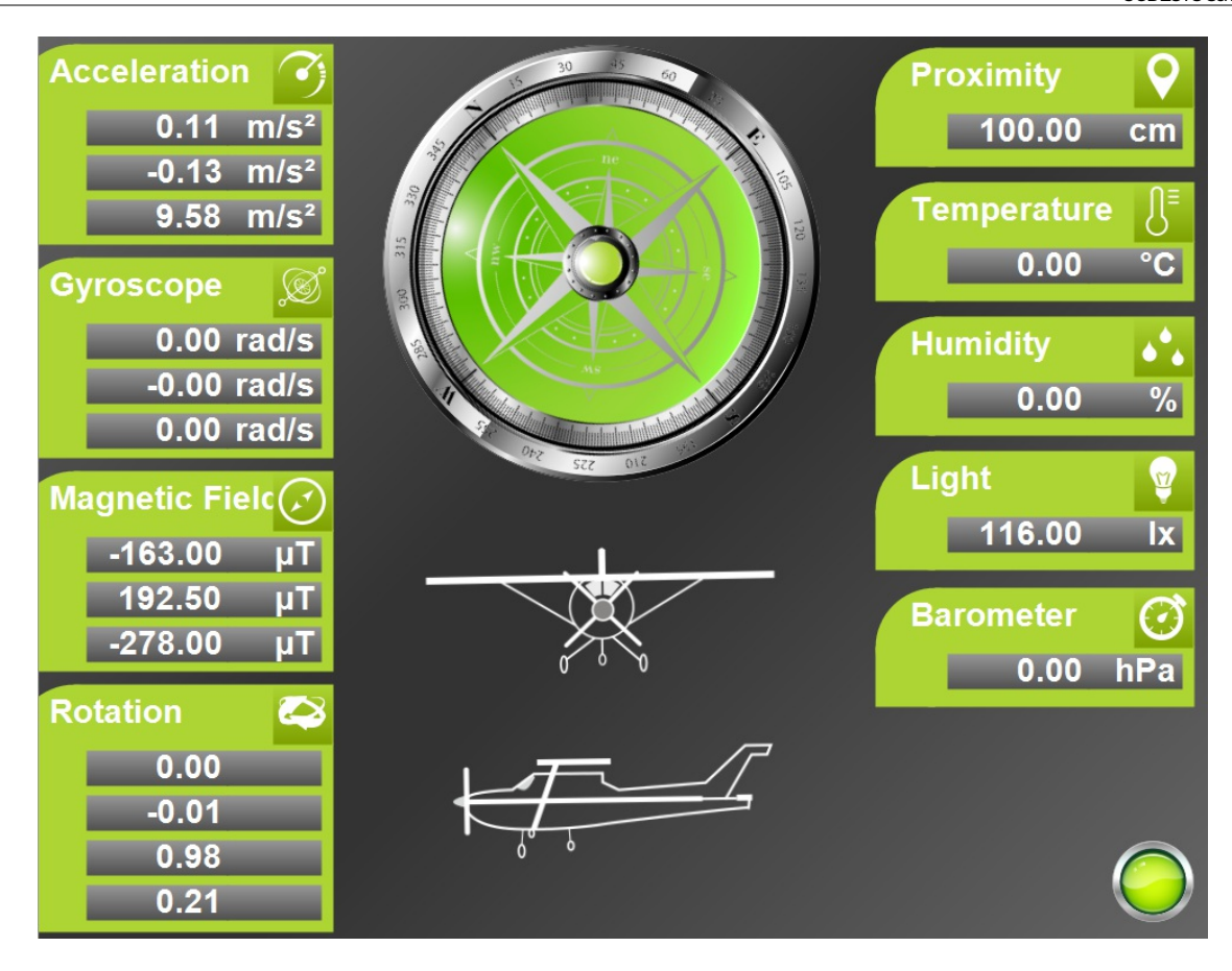
Screenshot: Representation of sensor data in the CODESYS Development System (AndroidSensorApp.project)